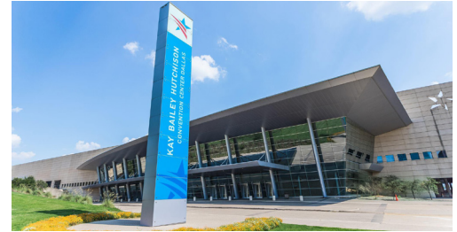
Kay Bailey Hutchison Convention Center