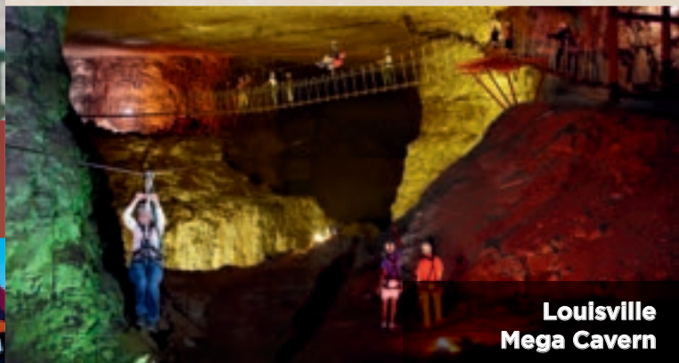
Louisville Mega Cavern