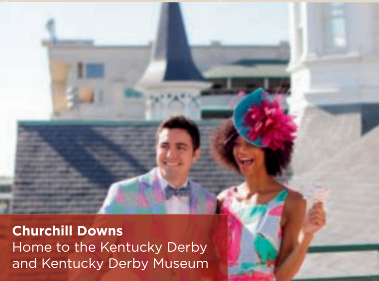
Churchill Downs Home to the Kentucky Derby and Kentucky Derby Museum

EXPERIENCE SOUTHERN HOSPITALITY WITH MODERN CHARM