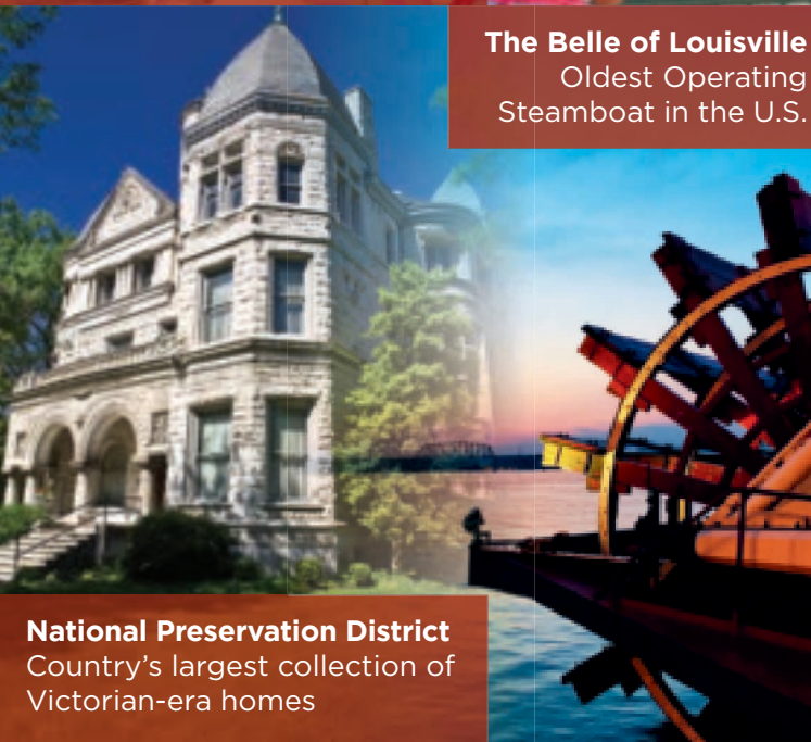
The Belle of Louisville Oldest Operating Steamboat in the U.S.